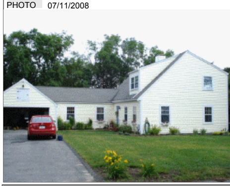
PHOTO 07/11/2008 BLDG COMMENTS