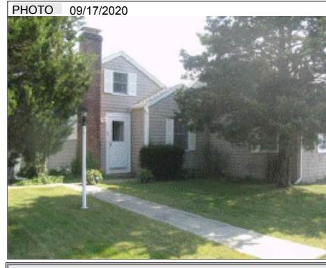
PHOTO 09/17/2020 BLDG COMMENTS