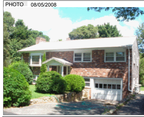
PHOTO 08/05/2008 BLDG COMMENTS