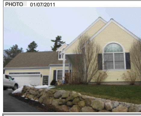
PHOTO 01/07/2011 BLDG COMMENTS