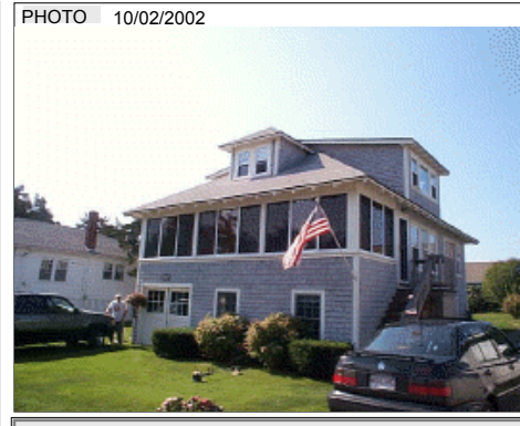
PHOTO 10/02/2002 BLDG COMMENTS