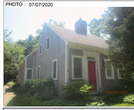
PHOTO 07/07/2020 BLDG COMMENTS ADDED 1 FIREPLACE PER SALES REPORT