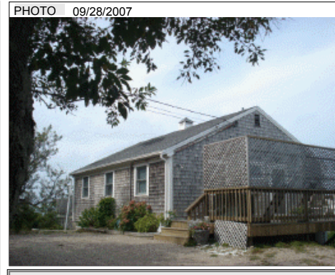
PHOTO 09/28/2007 BLDG COMMENTS PATH TO BEACH