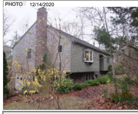
PHOTO 12/14/2020 BLDG COMMENTS IN-LAW APT IN LLF 20 SOLAR PANELS INFO @ DOOR (12/14/20)