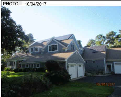
PHOTO 10/04/2017 BLDG COMMENTS 35 SOLAR PANELS EST