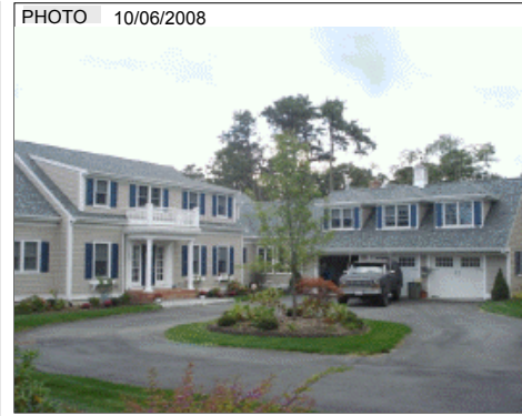
PHOTO 10/06/2008 BLDG COMMENTS