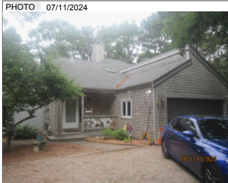
PHOTO 07/11/2024 BLDG COMMENTS UPSIDE DOWN HOUSE LLF=3 BEDRM/2 BATH INFO @ DOOR (2/17/21)