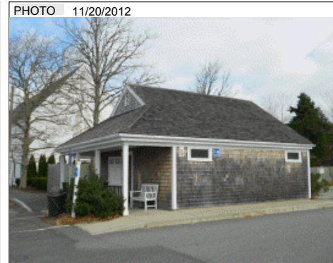
PHOTO 11/20/2012 BLDG COMMENTS PUBLIC REST ROOMS