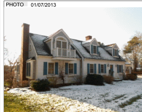
PHOTO 01/07/2013 BLDG COMMENTS