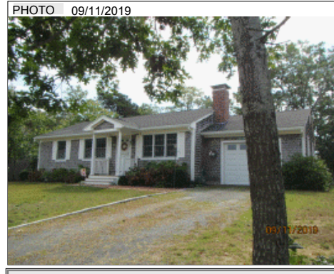
PHOTO 09/11/2019 BLDG COMMENTS PULL DOWN STAIRS TO ATTIC ACCESS IN AGR