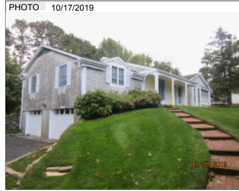
PHOTO 10/17/2019 BLDG COMMENTS