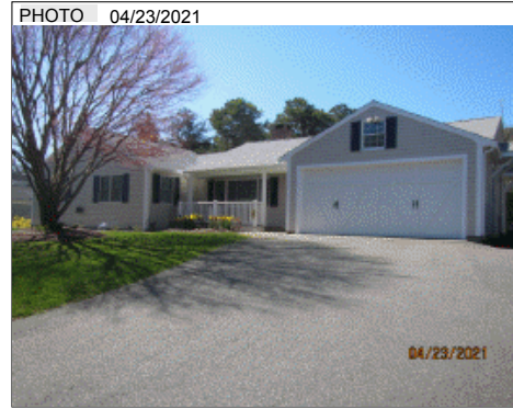
PHOTO 04/23/2021 BLDG COMMENTS BMF=EX RM/BDRM/BATH (PER PLANS 7/14/21)