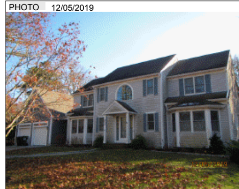
PHOTO 12/05/2019 BLDG COMMENTS BMF=RECRM, EXERCISE RM, FULL BATH, BAR PER PLANS