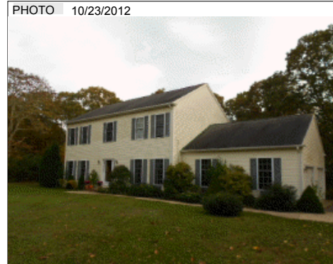
PHOTO 10/23/2012 BLDG COMMENTS