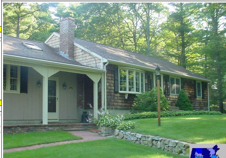
186 BIRCH ST