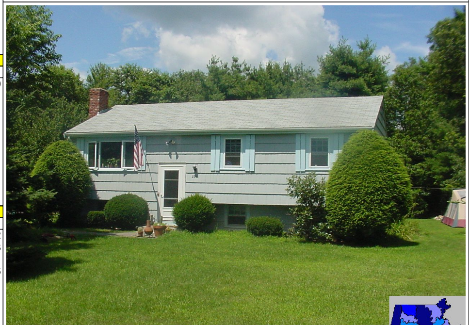
298 AUTUMN AVE