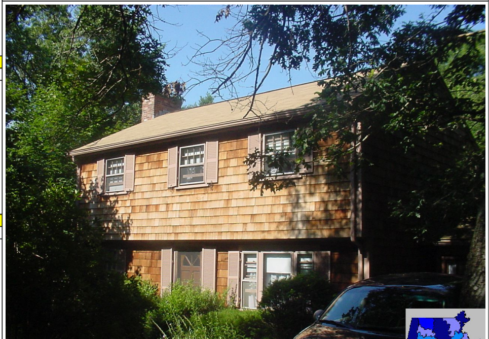
322 LAKE SHORE DR