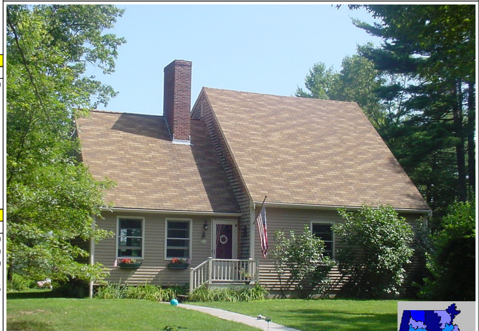
144 LAKE SHORE DR