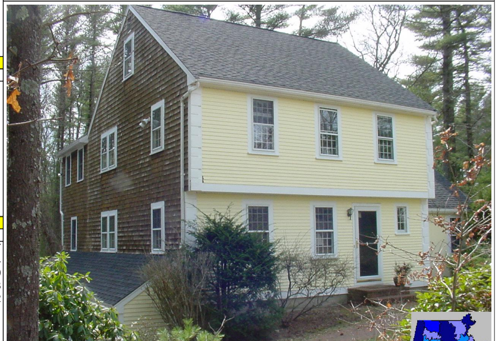
4 BRISTOL DR