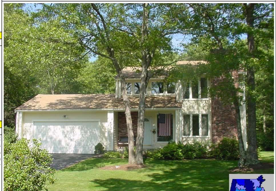
13 BRISTOL DR