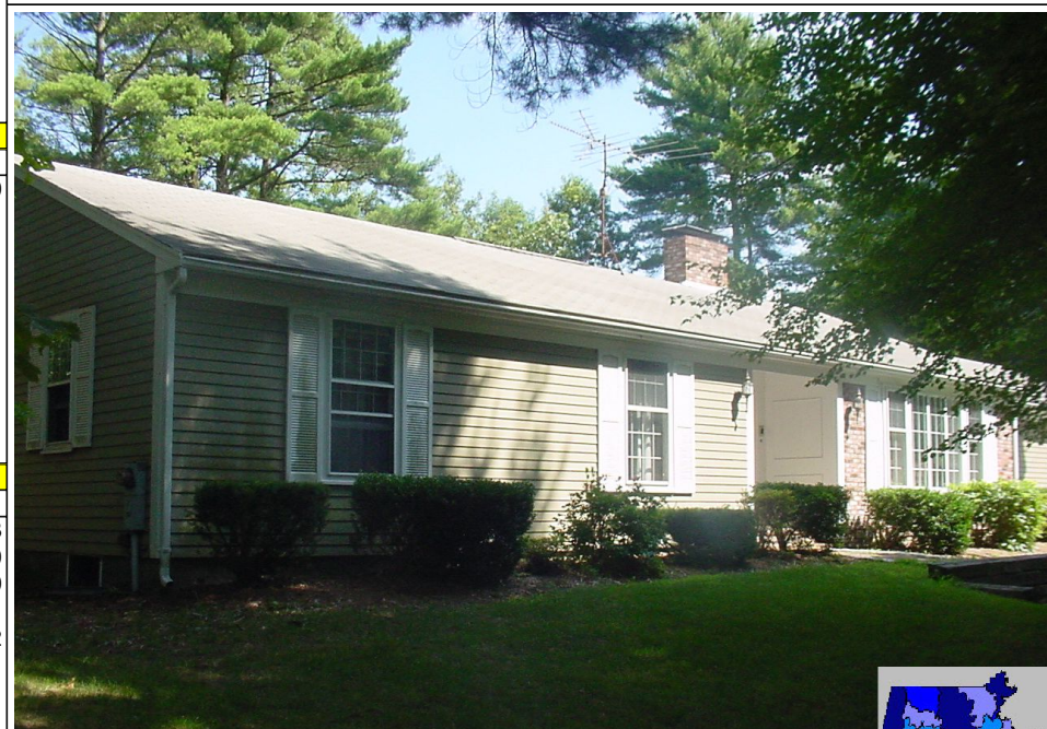
1 BRISTOL DR