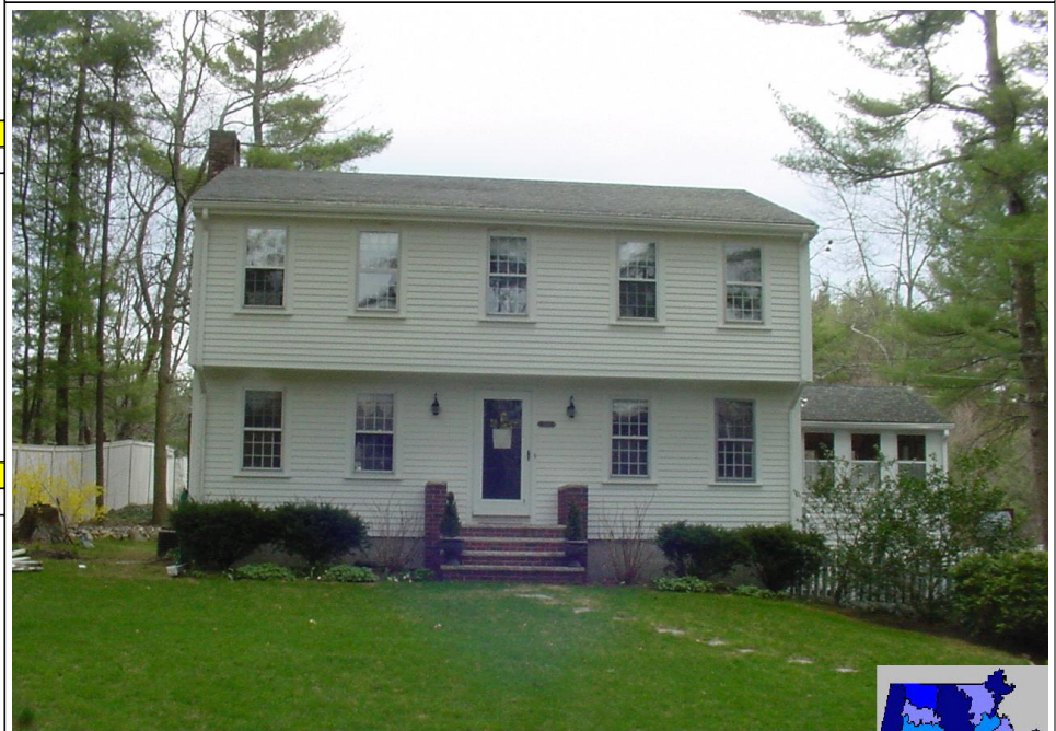
51 MEADOW LN