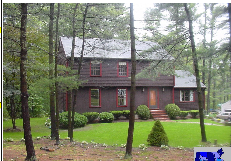
12 DEERPATH TRL S