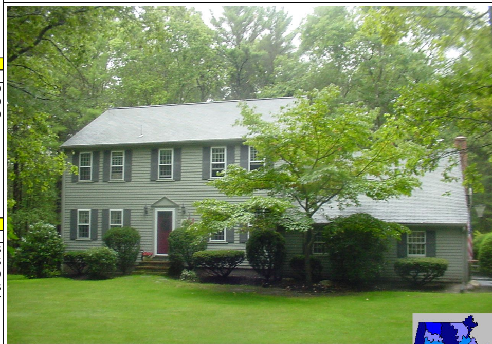
33 HIGHLAND TRL S