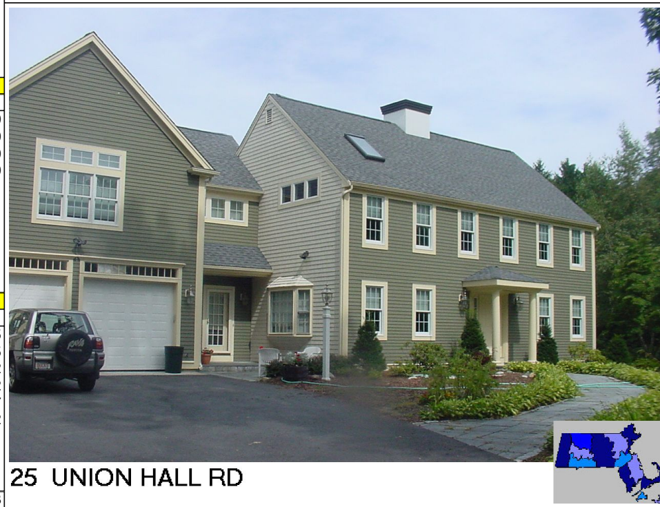
25 UNION HALL RD