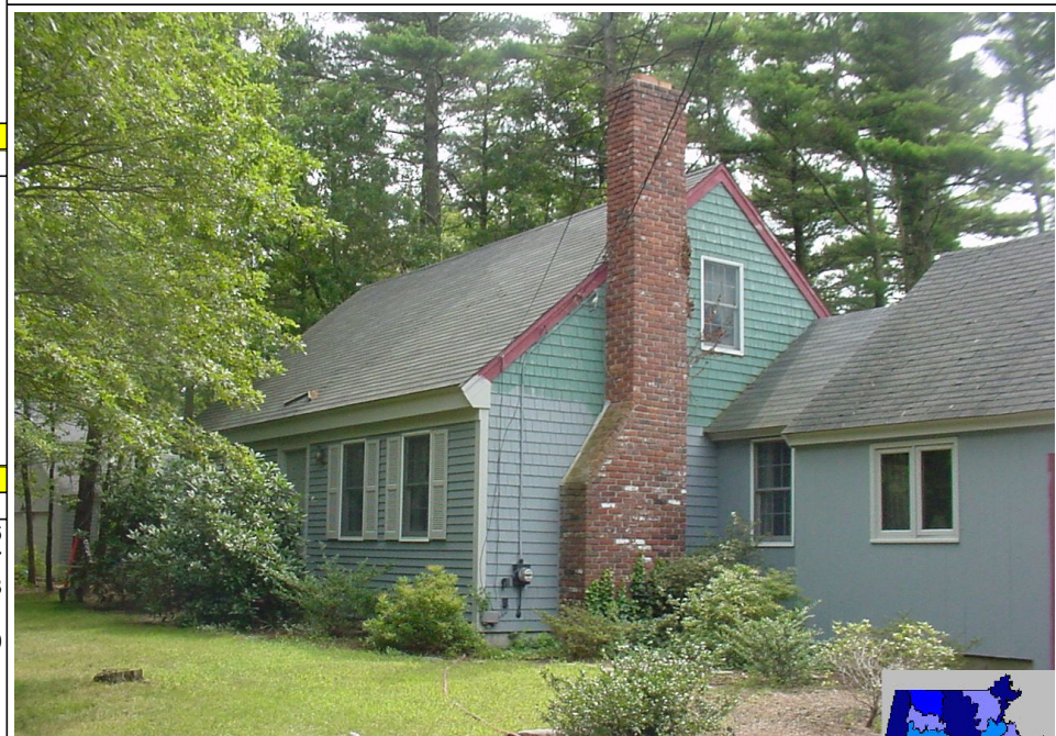
831 WEST ST