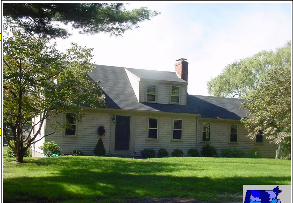
670 LINCOLN ST