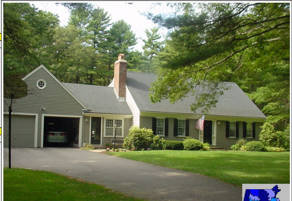
414 LINCOLN ST