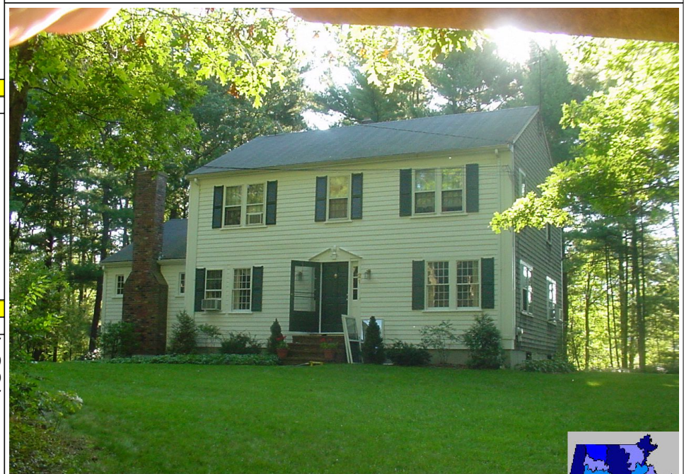
21 WRIGHT LN