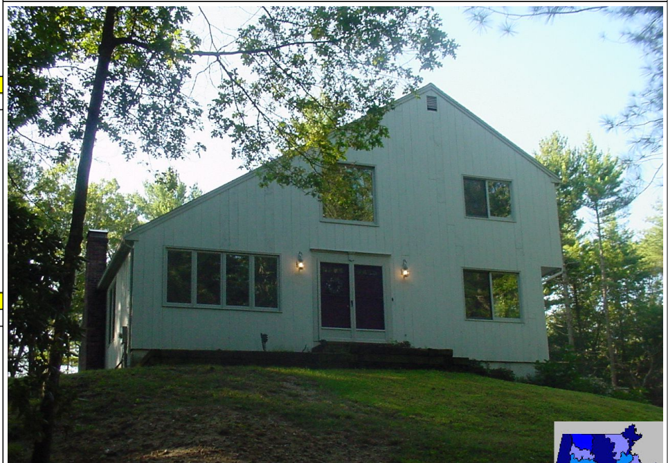
41 WRIGHT LN