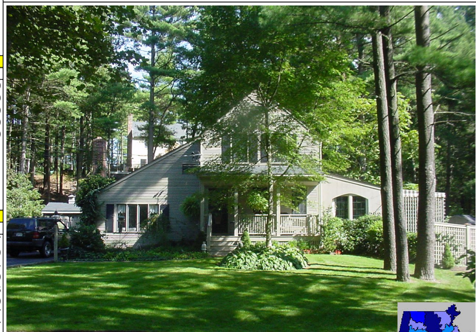
585 LINCOLN ST