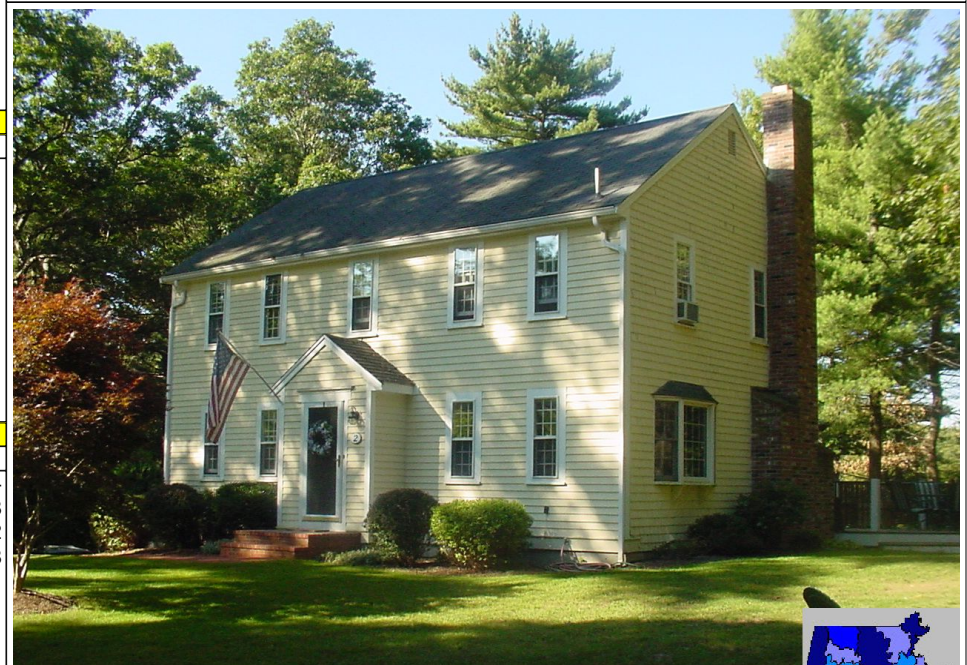
2 OHTAG PATH