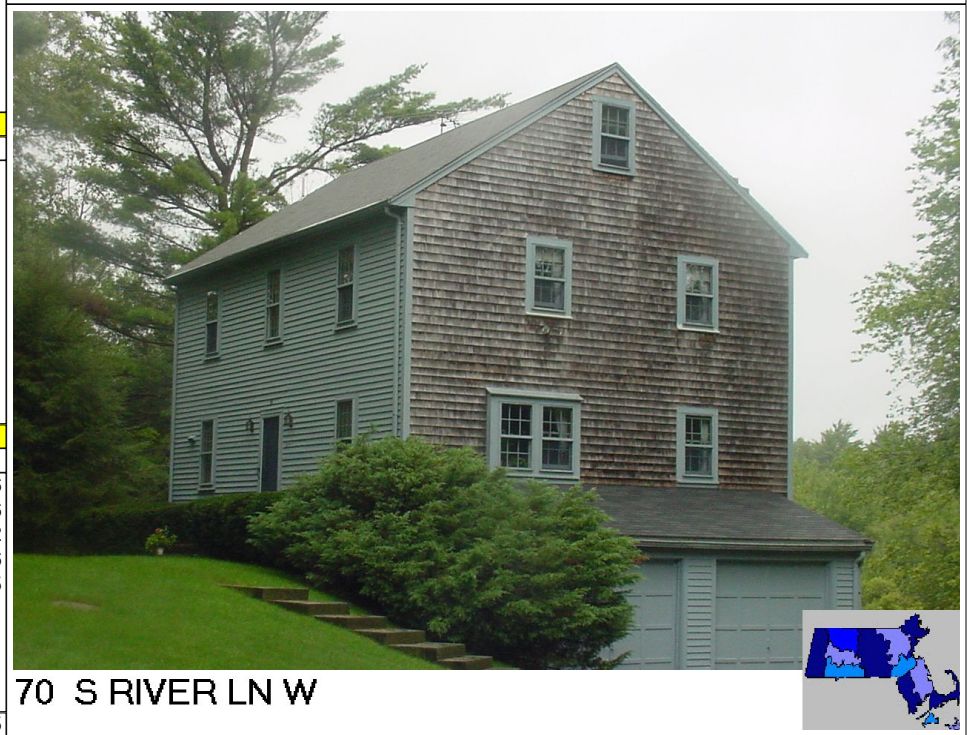
70 S RIVER LN W