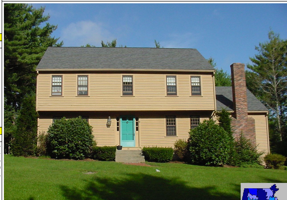
30 HIDDEN ACRES DR