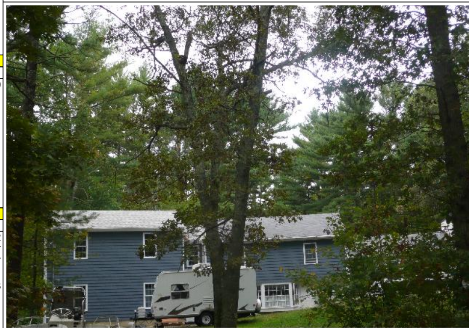
38 KING PHILLIPS PATH