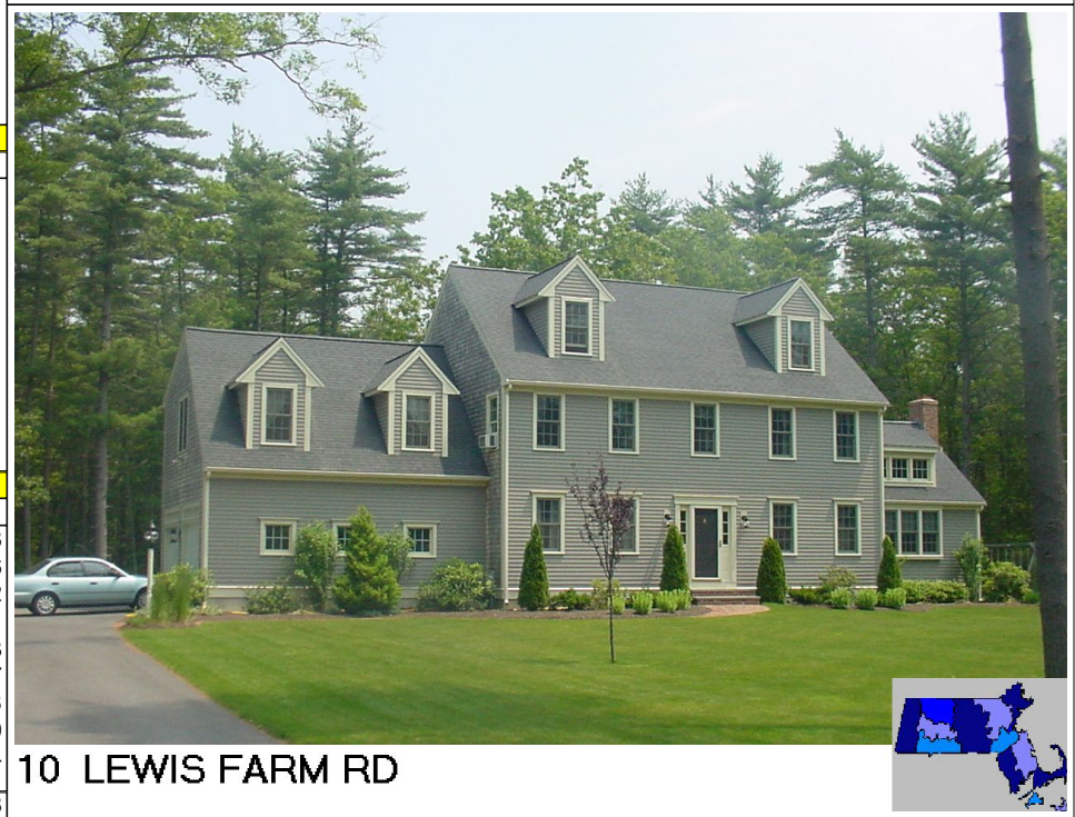
10 LEWIS FARM RD