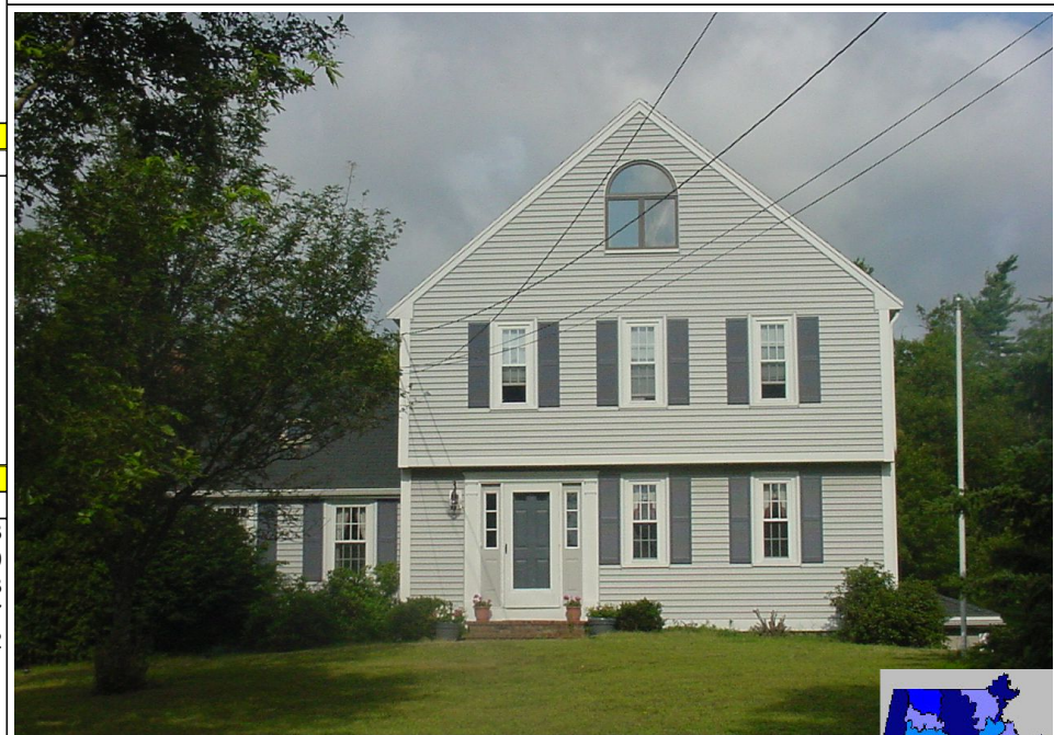
66 LINCOLN ST