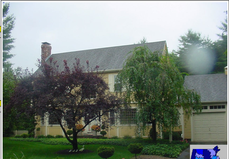
15 MALLARD COVE LN