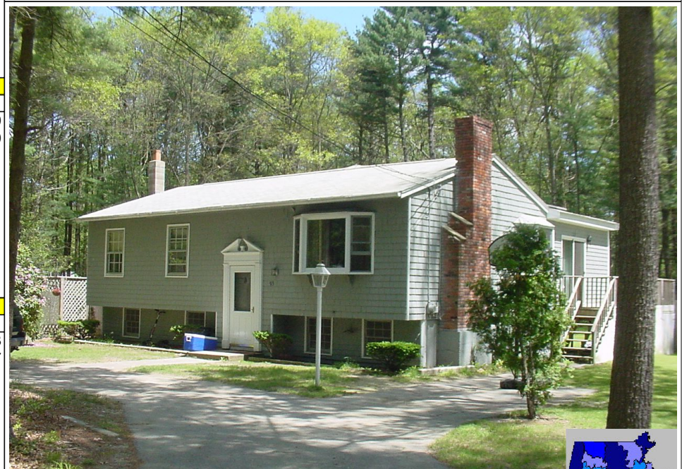
93 UNION BRIDGE RD