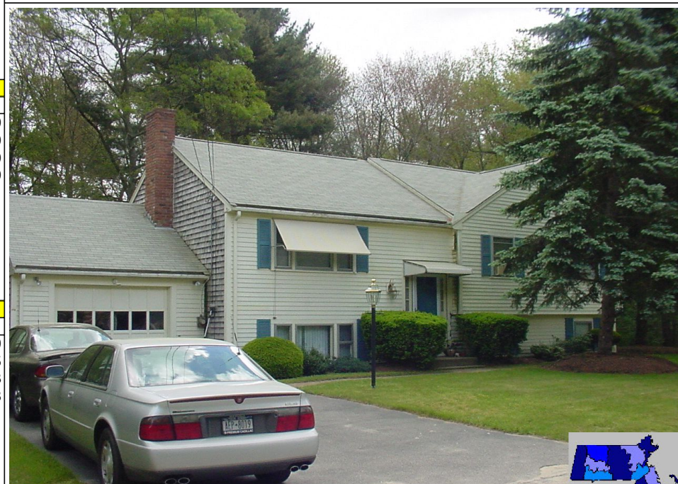
37 BIANCA RD