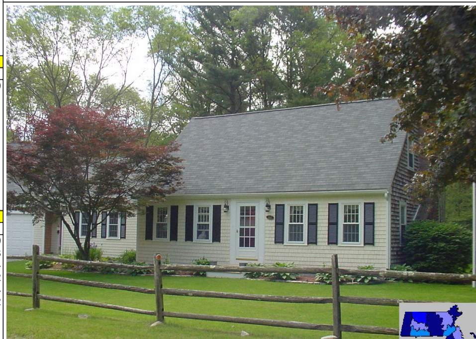
161 BIANCA RD