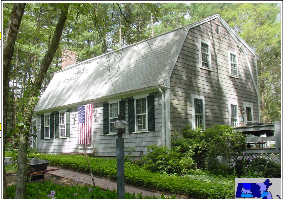
182 BIANCA RD