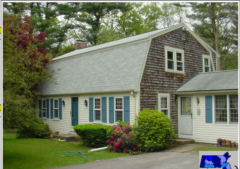
15 TURKEY RIDGE LN