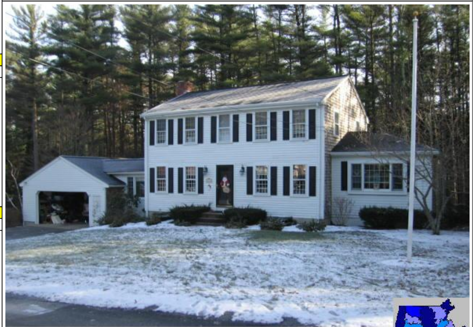
35 CHRISTINA CT