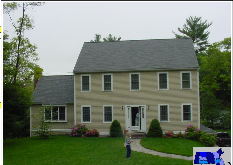
1 GARDNER RD