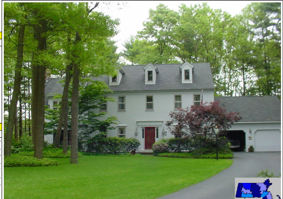
45 COLES ORCHARD RD